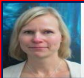
Inari Karonan Languages