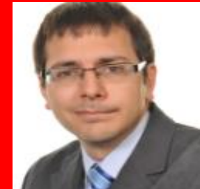
James Wilkinson Houses